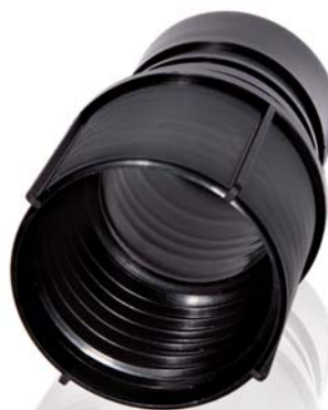
Boiler connection with inside thread