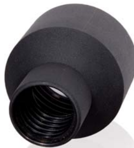
Standard sleeve with reduction