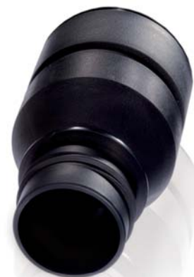
Boiler connection outside thread