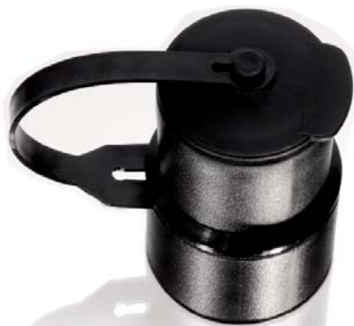
Sleeve with lug & clip