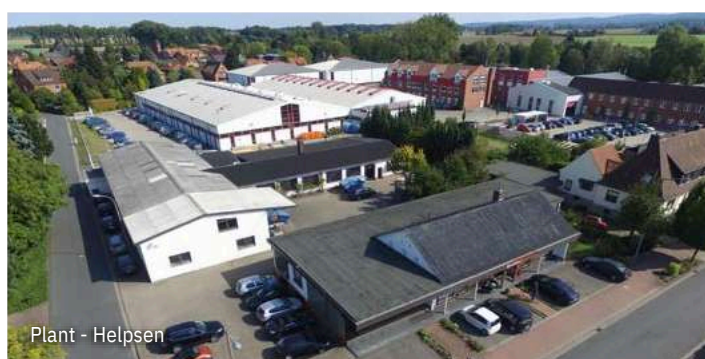
Plant - Helpsen

PRECIMA Magnettechnik GmbH was founded in the year 1981 and is today established as an independent, medium sized, innovative family owned brake manufacturer. With our staff of more than 160 employees we develop and produce a wide range of electro-magnetic operated brakes and clutches for all kinds of applications in machine and other industries. Our standard range of products covers a performance scope of braking torques between 0.5 and 1,600 Nm.