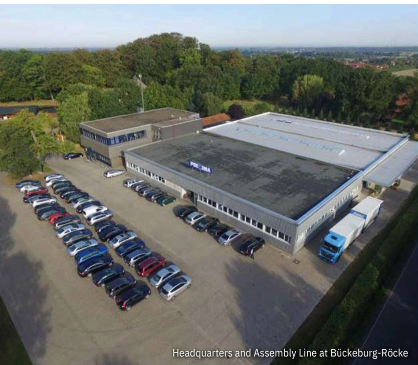
Headquarters and Assembly Line at Bückebug-Röcke