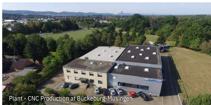
Plant - CNC Production at Bückebug-Müdingen