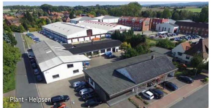
Plant - Helpsen

PRECIMA Magnettechnik GmbH was founded in the year 1981 and is today established as an independent, medium sized, innovative family owned brake manufacturer. With our staff of more than 160 employees we develop and produce a wide range of electro-magnetic operated brakes and clutches for all kinds of applications in machine and other industries. Our standard range of products covers a performance scope of braking torques between 0.5 and 1,600 Nm.