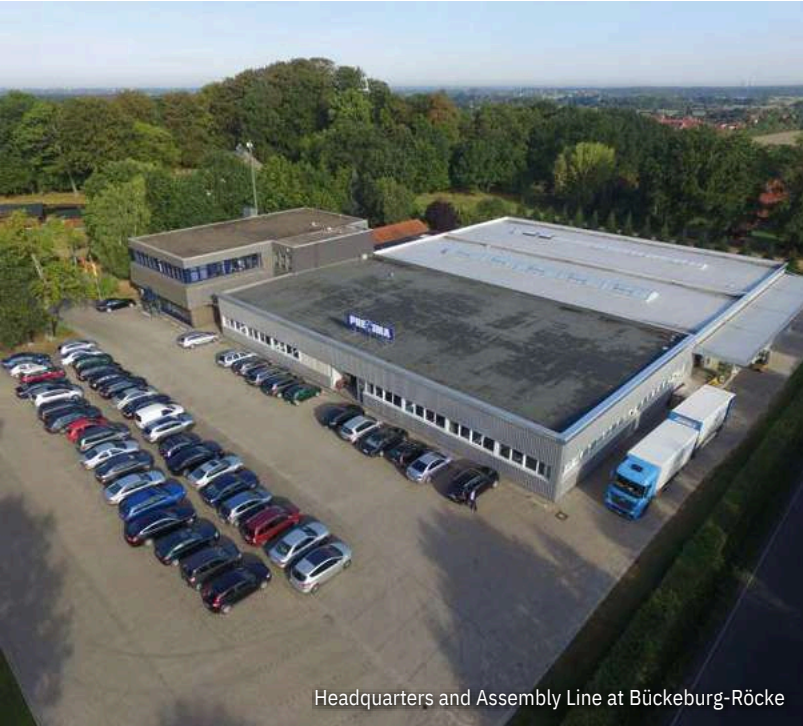
Headquarters and Assembly Line at Bückeburg-Röcke