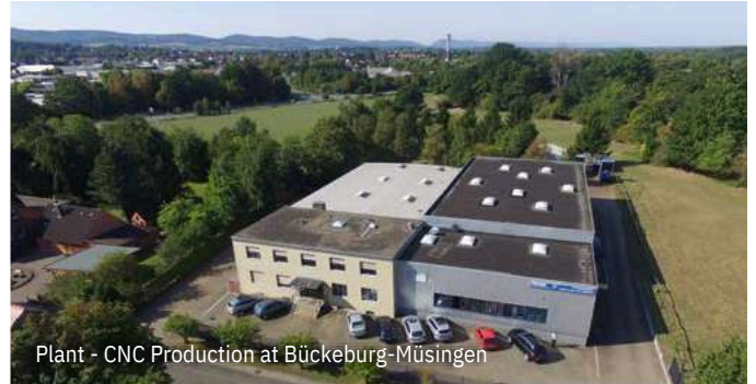
Plant - CNC Production at Bückeburg-Müdingen