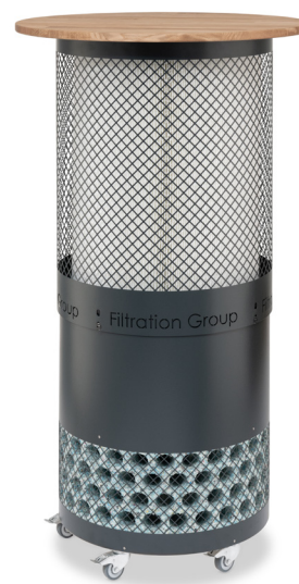
SilentCare as standing table